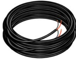
QU250 (250 ft)