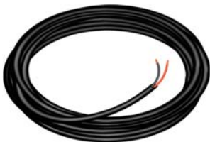
QU100 (100 ft)