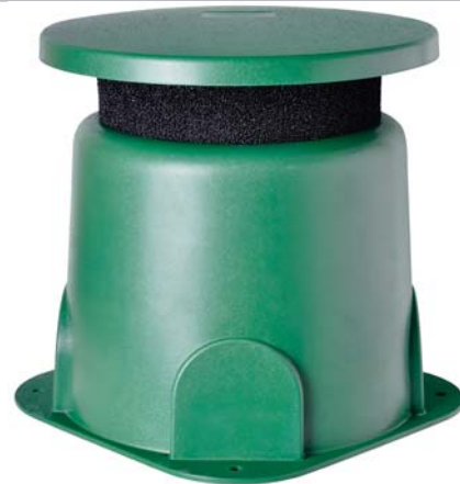
QGM (6½" 360° sound)