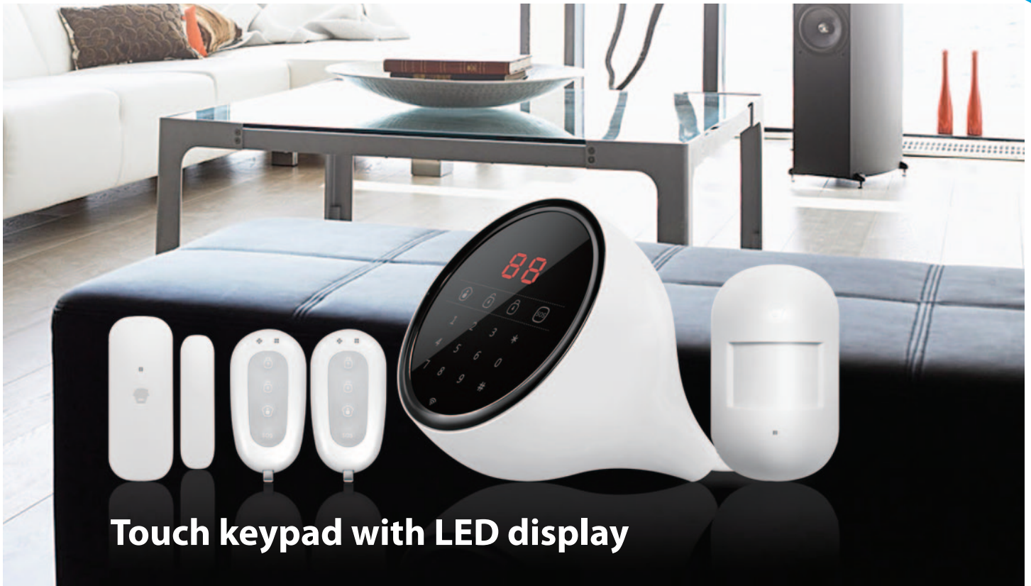
Touch keypad with LED display