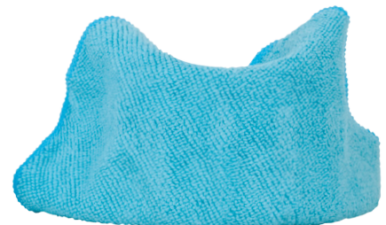
Anti-static and lint free micro fiber cleaning cloth