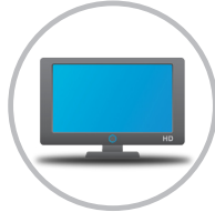
Flat Screen tv's