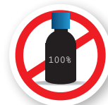
Alcohol and ammonia free