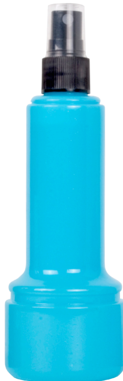
150ml high quality screen cleaner with drip free formula