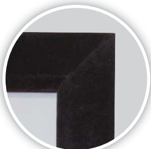
Anti-Glare Velour Finish