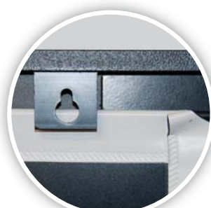
Integrated Hanging Bracket