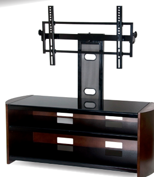
S62V50 Shown with optional 173PE-N