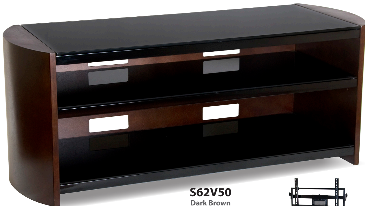
S62V50 Dark Brown