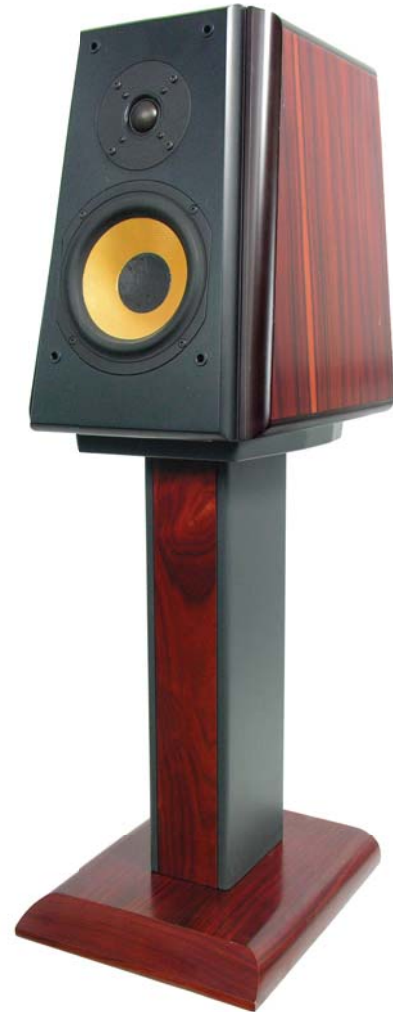
OPUS-V, shown on TLS-V Stand

TLS-V SPEAKER STANDS: Engineered to complement the OPUS-V series, the matching TLS-V stands come factory-filled with acoustic sand to eliminate unwanted vibration. Held securely in position, the OPUS-V is elevated to its optimal performance height. Stand adjustments are easily made with the supplied leveling spikes that further reduce unwanted vibration.