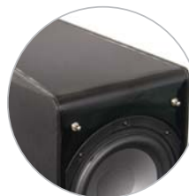
Continuous lacquered top, front & rear

Both towers are adorned with a sleek and stable plinth. Gently curved sides frame a beautiful high gloss lacquered top and front baffle. Detailed edge contours soften and stylize the Inspira elegantly.