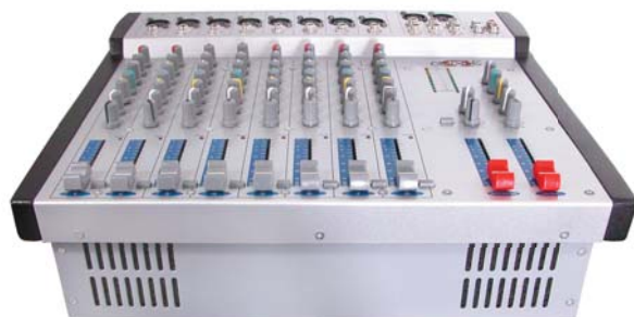
MX8-P with amplifier