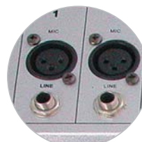
XLR or 1/4 inch Inputs