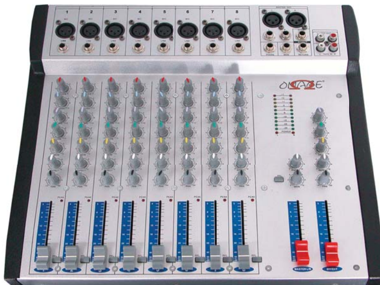
MX8 without amplifier

Hear the difference with an Omage Spectrum professional mixer. Portable and easy to use, the amplified 120 watts per channel MX8-P and the passive MX8 both feature full-metal body construction.